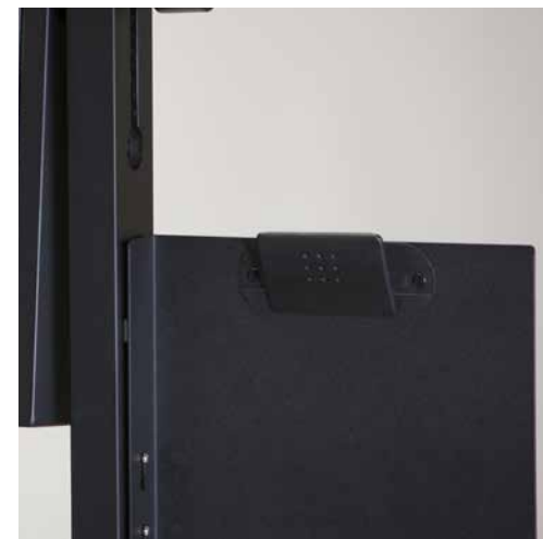
PROJECTS HOLDING STAND Removable made of aluminium