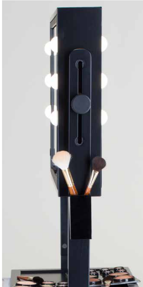
L400X2-FO DOUBLE MIRROR VERSION

The version with lighted mirror on both sides is ideal for make-up schools: up to 4 students can work simultaneously on a single station.