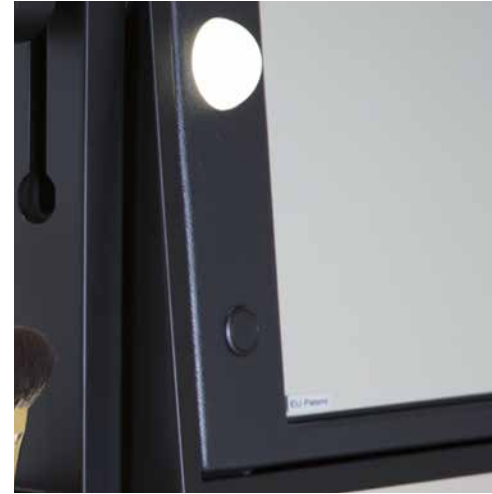
I-light lights Dimmer button for adjusting light brightness