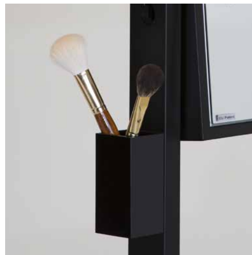
BRUSH-HOLDING GLASS removable and washable