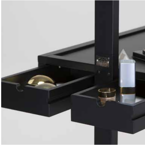
Top with 4 convenient drawers openable by the side