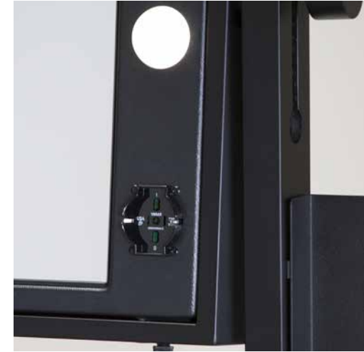
110-240V universal power socket

The L400 wheeled make-up station combines space, image and professionalism. It features 6 framed I-light lamps and universal power socket. Ideal solution for shops and stores. The version with double mirror (front and back) is ideal for make-up and hair-styling academies.