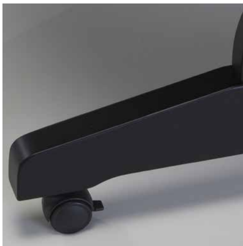
FOUR STURDY WHEELS Pivoting with brake