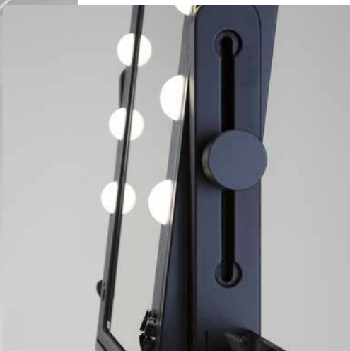
LARGE TILTING MIRROR adjustable in height with 6 I-LIGHT LIGHTING points by CANTONI

I-Light dimmer, the exclusive lighting system for the make-up patented by Cantoni, it is fitted as standard on these mobile stations..