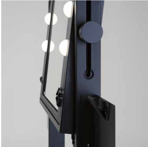
KNOB to lock mirror tilting angle and height