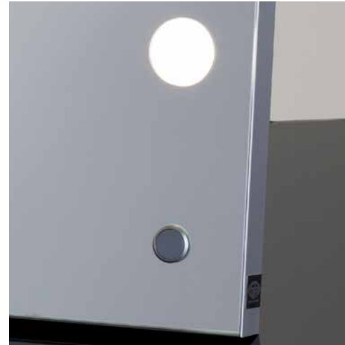
I-light lighting professional system with 6 light spots adjustable in brightness

As all the products of the Cantoni range, this portable vanity mirror is handcrafted in Italy.