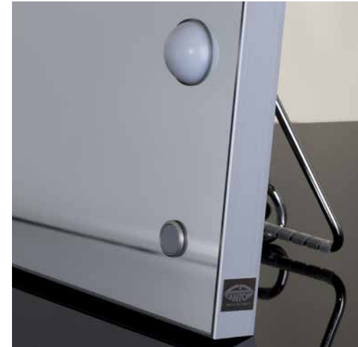
Satin aluminium profile, lighted lenses and actuator placed in the mirror

The MDE504-Table is the ideal solution for setting up makeup schools and makeup stations where it is a priority managing multi-purpose spaces. The MDE-Table 504 has both the correct size and the ideal light to be used during professional makeup sessions and the light weight and the ease of use of a movable piece of furnishing.