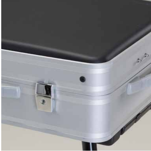
ANODIZED ALUMINIUM PROFILE ABS STRUCTURE Convex design Cover