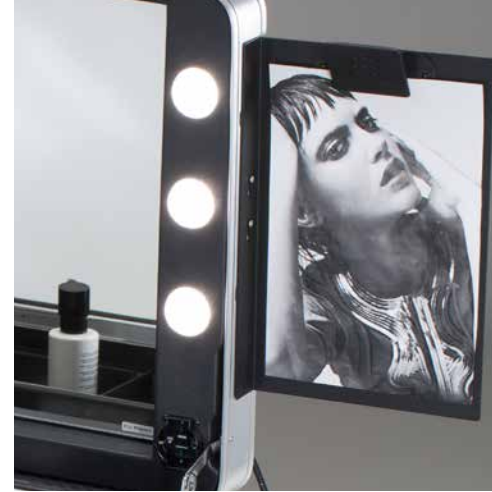
HOLDING FACE-CHART STAND Universal power socket 110-240V