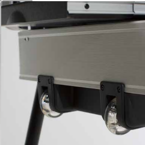
TRANSPARENT RUBBER WHEELS with ball bearings

Extremely versatile because compact, durable, easy to carry, is the perfect solution for those who travel often, even on foot. It guarantees a professional image at the highest level.