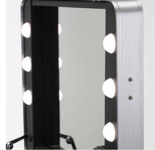
CANTONI I-LIGHT LIGHTING SYSTEM with dimmer button to adjust the brightness