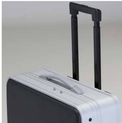
TELESCOPIC TROLLEY with spring lock button REINFORCED STRAP HANDLES