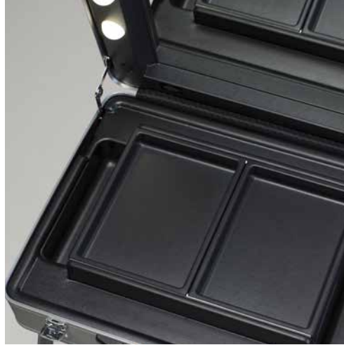
THERMOFORMED INTERIOR Magnetic lock sliding trays with aluminium guides. Large interior