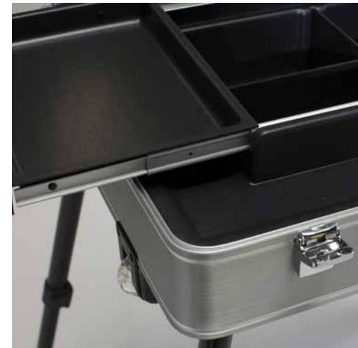
SLIDING TRAYS KEY LOCKS