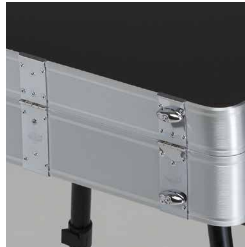
REINFORCED CHROME HINGES