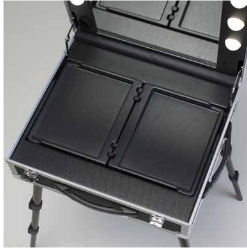
Removable trays that can be positioned on the sides of the case with suitable hooks. Removable partitions inside the container