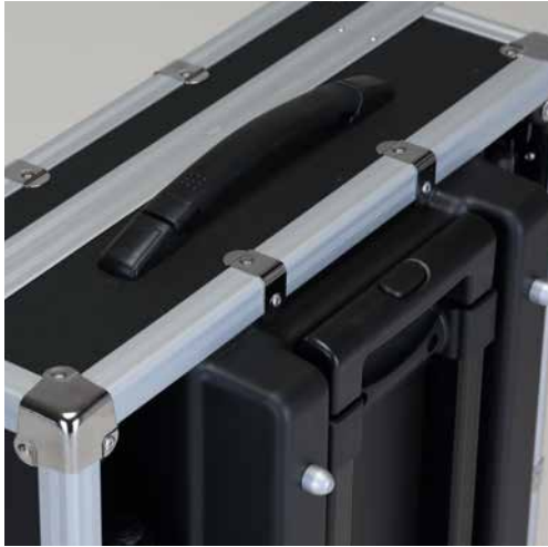
Built-in trolley with square section telescopic handle. Handle with lock button.