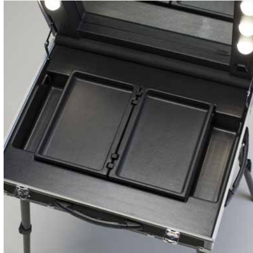
Removable trays that can be positioned on the sides of the case with suitable hooks. Removable partitions inside the container