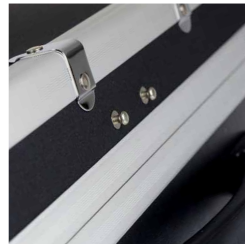
PRE SET-UP SYSTEM with standard locking system for the face-chart holding project