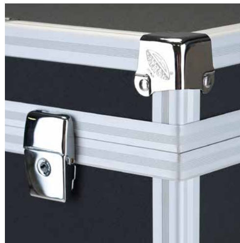
ANODISED ALUMINIUM PROFILES CHROME ACCESSORIES KEY LOCK