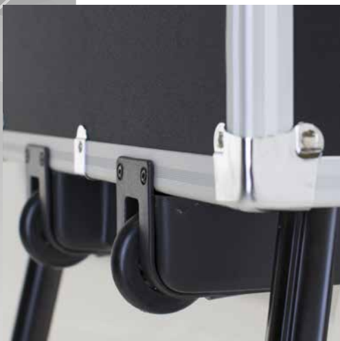
RUBBER WHEELS with ball bearings

Quick and easy opening and closing system, thanks to the built-in telescopic legs. Details with engraved Cantoni logo.