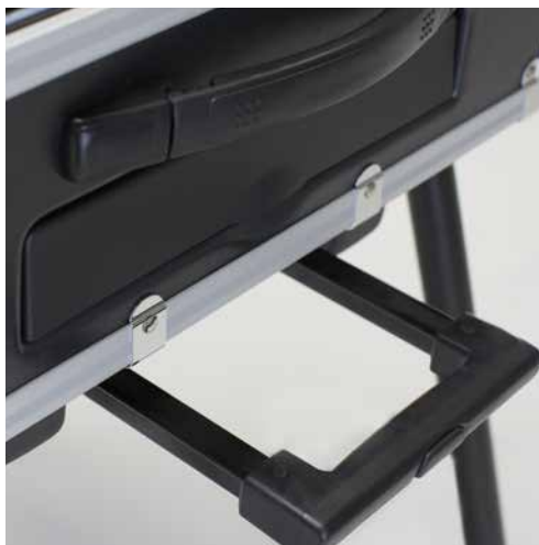
TELESCOPIC TROLLEY with spring lock button REINFORCED STRAP HANDLES