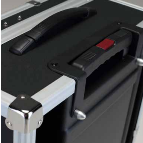
Trolley with square section telescopic handle. Retractable handle with locking button.