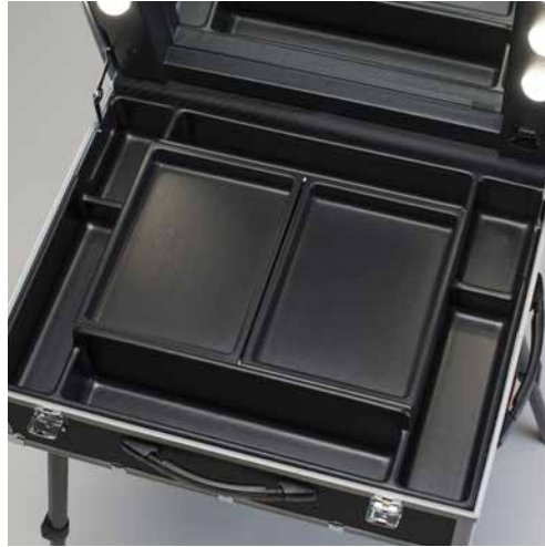
Large central compartment, sliding trays with aluminium guides, magnetic closure