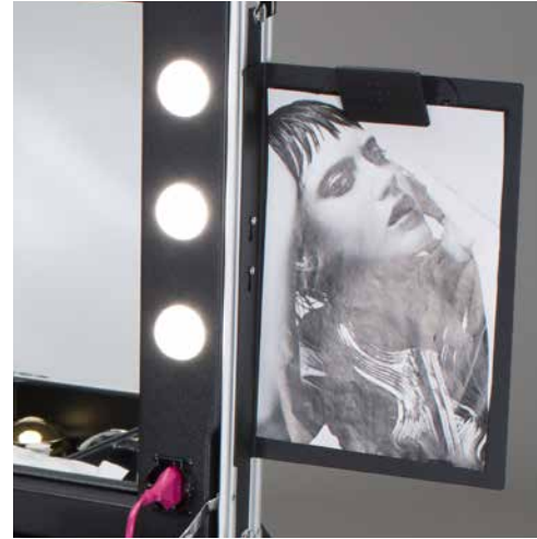
HOLDING FACE-CHART STAND Universal power socket 110-240V