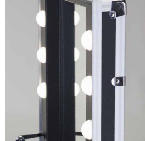
CANTONI I-LIGHT LIGHTING SYSTEM with dimmer button to adjust the brightness

The VT101C-TR station is the make-up case that combines ideal capacity, comfortable work spaces and transportability.