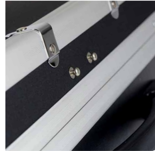
PRE SET-UP SYSTEM with standard locking system for the face-chart holding project