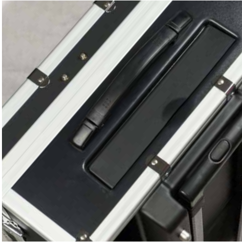
Built-in trolley with square section telescopic handle. Handle with lock button.