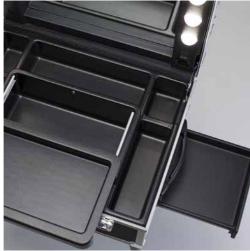
Sliding top tray with aluminium guides and deep main compartment, side drawer with magnetic closure.