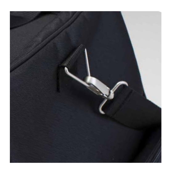
ADJUSTABLE AND DETACHABLE SHOULDER STRAP