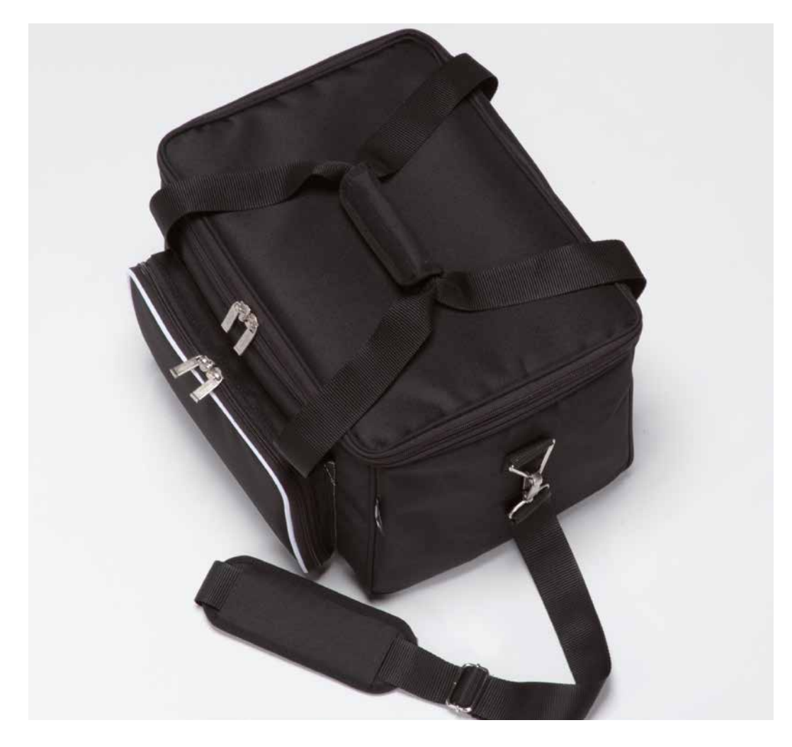
BB2.N with 5 boxes