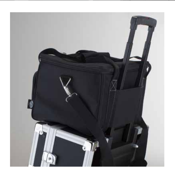
Rear flap to insert on trolley handle all Cantoni make-up stations