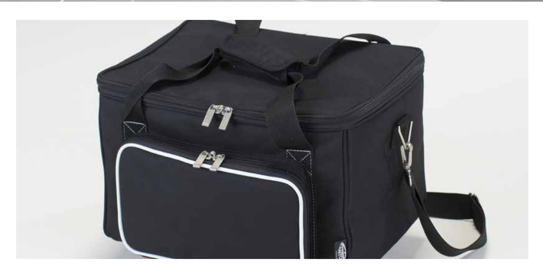
Padded technical fabric, zipper closures Adjustable shoulder strap, reinforced handles