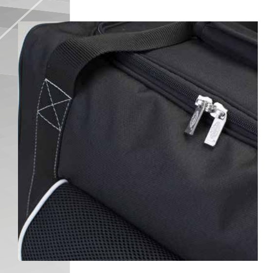
PADDED TECHNICAL FABRIC

It is possible to choose to customize the outside of the bags by Cantoni with a specific logo or name. Hand made in Italy.