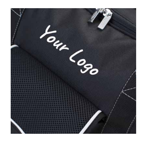
EXAMPLE OF PRINTED LOGO